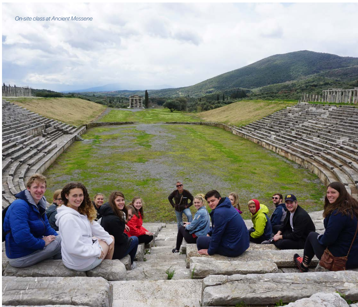
On-site class at Ancient Messene

Students are often able to transfer some or all of their financial aid package toward CYA fees. Students should inquire with their home institutions first.