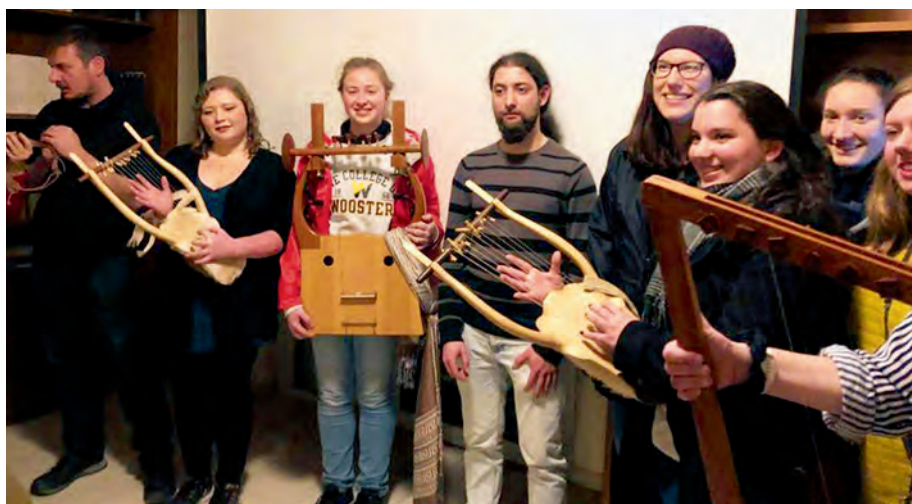
CYA students visit Archaeopolis.